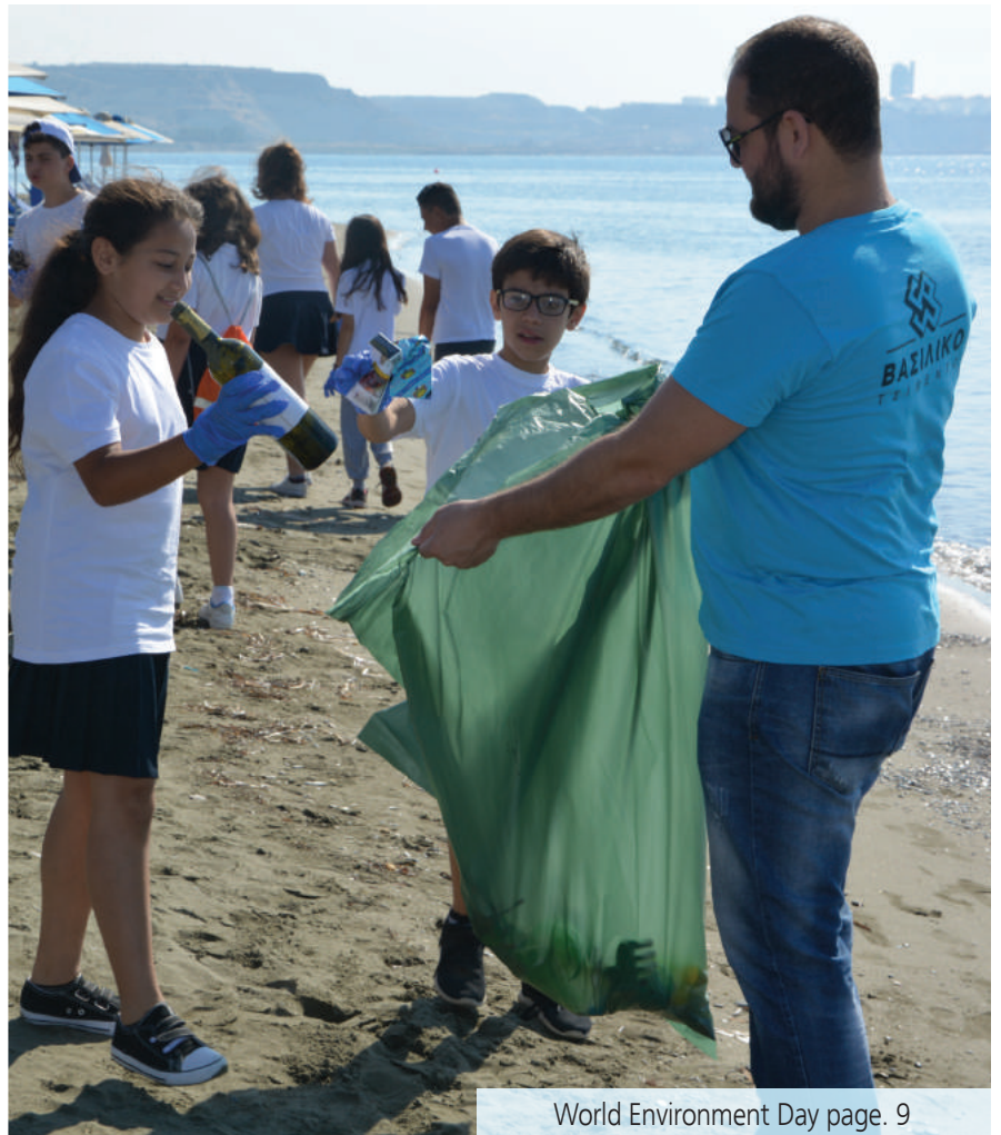
World Environment Day page. 9