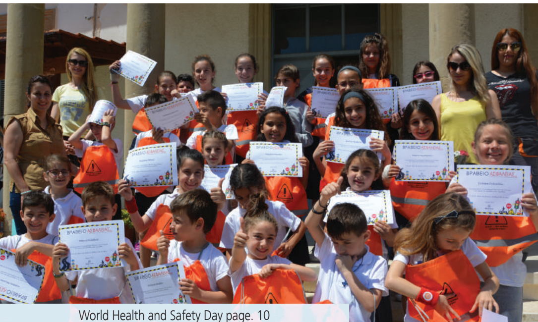
World Health and Safety Day page. 10

“ Our vision is to excel as a Successful company, based on principles which at their core encompass Respect and Contribution. ”